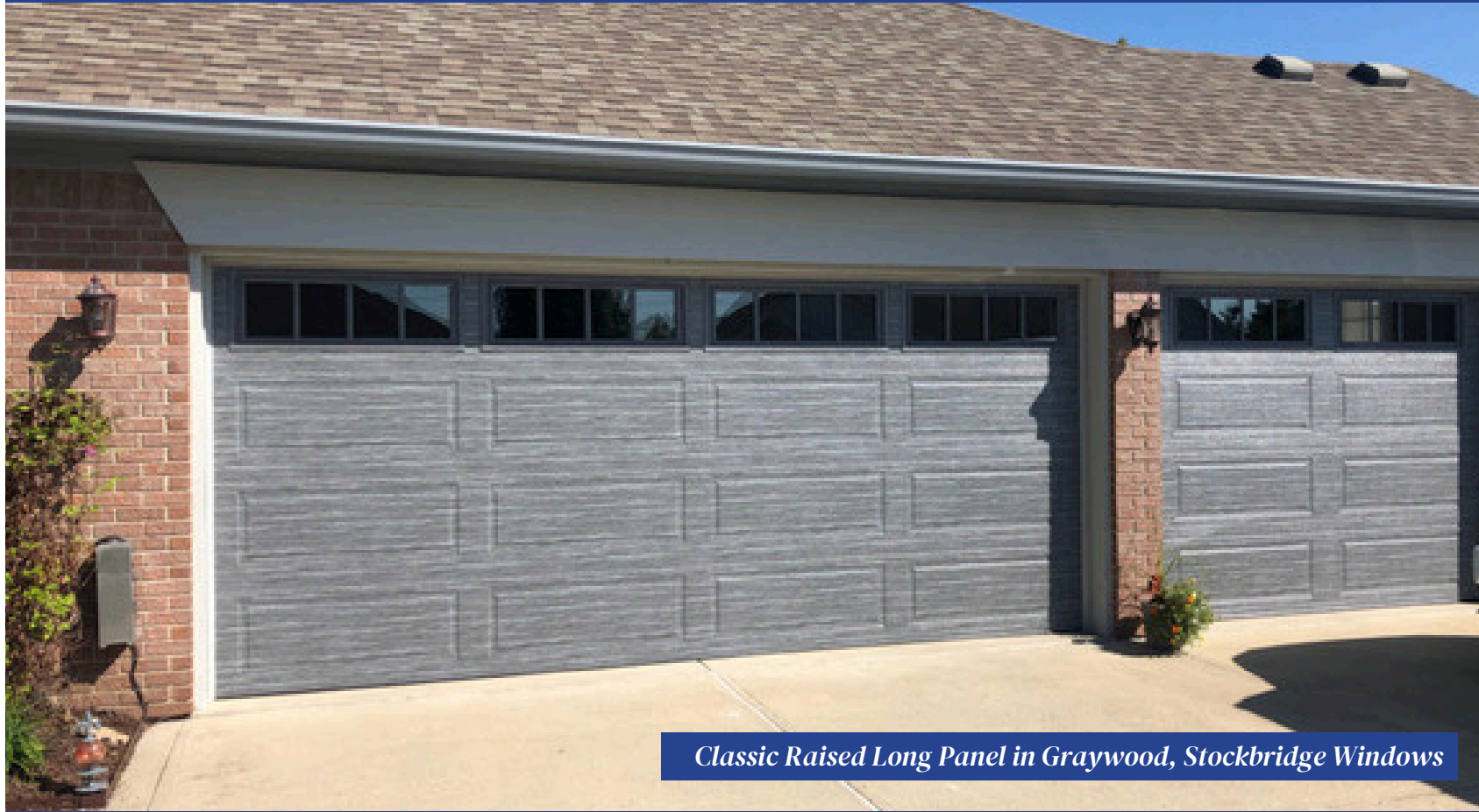
Classic Raised Long Panel in Graywood, Stockbridge Windows